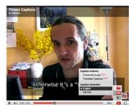
Figure 1: Examples of close-caption on the internet and the menu available to the viewer with the different possibilities. From http://www.google.com/support/ youtube/bin/answer.py?hl=en&answer=140174

In websites such as "Your Local Cinema" (http://www.yourlocalcinema. com/) we can find invitations like the following for people to subtitle movies clips into other languages, thus making the website accessible to non-English speakers: