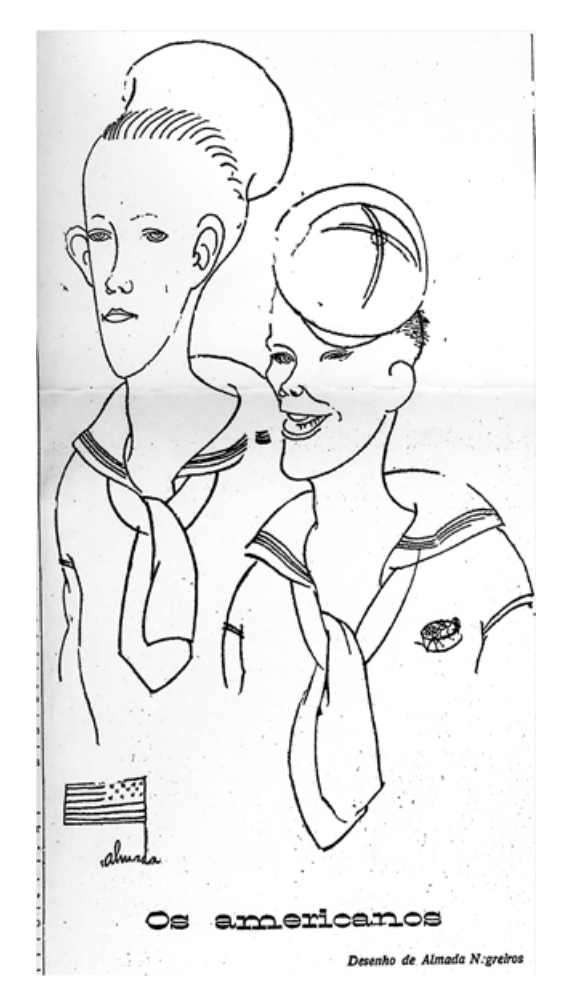
that they do it in the childish, primitive and

humor inglês, e que é severo como um juiz. Os seus rostos são de linhas puras, correctíssimas, femininas, ou de linhas rasgadas, caricaturais, indianas. Os dois tipos característicos dos americanos que pejam Lisboa, correspondem ao homem bárbaro, que se vestiu de branco e foi para bordo de um couraçado civilizar o mundo, e ao homem civilizado à latina, filho da beleza de La Fayette, e a quem a França deu a liberdade. O primeiro vai desaparecendo. Se repararem bem, hão-de ver que os americanos fazem tudo o que fazem, brutal e experimentadamente, os latinos, com a diferença única de que eles o fazem com infantilidade, primitivismo, graça dos primeiros dezasseis anos. [...]" (3)