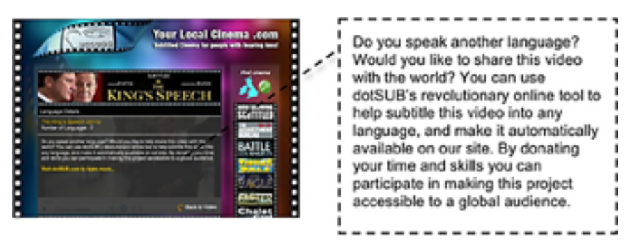
Figure 2: Screenshot of the invitation to amateur subtitling on the website "Your Local Cinema".

In websites such as "Your Local Cinema" (http://www.yourlocalcinema. com/) we can find invitations like the following for people to subtitle movies clips into other languages, thus making the website accessible to non-English speakers: