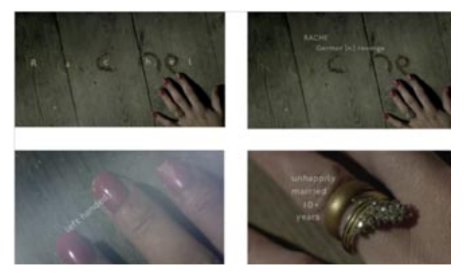
Figure 3: Screenshots of the episode 1: "A Study in Pink" of the first series of Sherlock (2010), BBC productions.

It is also undeniable that some of the innovations assumed in fansubbing have already filtered into the profession, especially in television channels or DVD productions targeted at a younger generation used to reading (and, in many case, used to including in their own translations) non-standard language, colors, smilies and (a more extreme example) pop-up notes with information on the cultural context. These have also started to influence film production. A good example is the series Sherlock, a BBC remake of Conan Doyle's classic placed in the twenty-first century, where Sherlock's thoughts appear written on screen and move with the image.